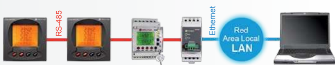
Fig. 1. Master-slave standard function

TCP2RS+ es el único conversor del mercado con alimentación multi-rango (85...290 Vc.a. / 120...410 Vc.c.) y fijación a carril DIN en tan sólo 2 módulos.